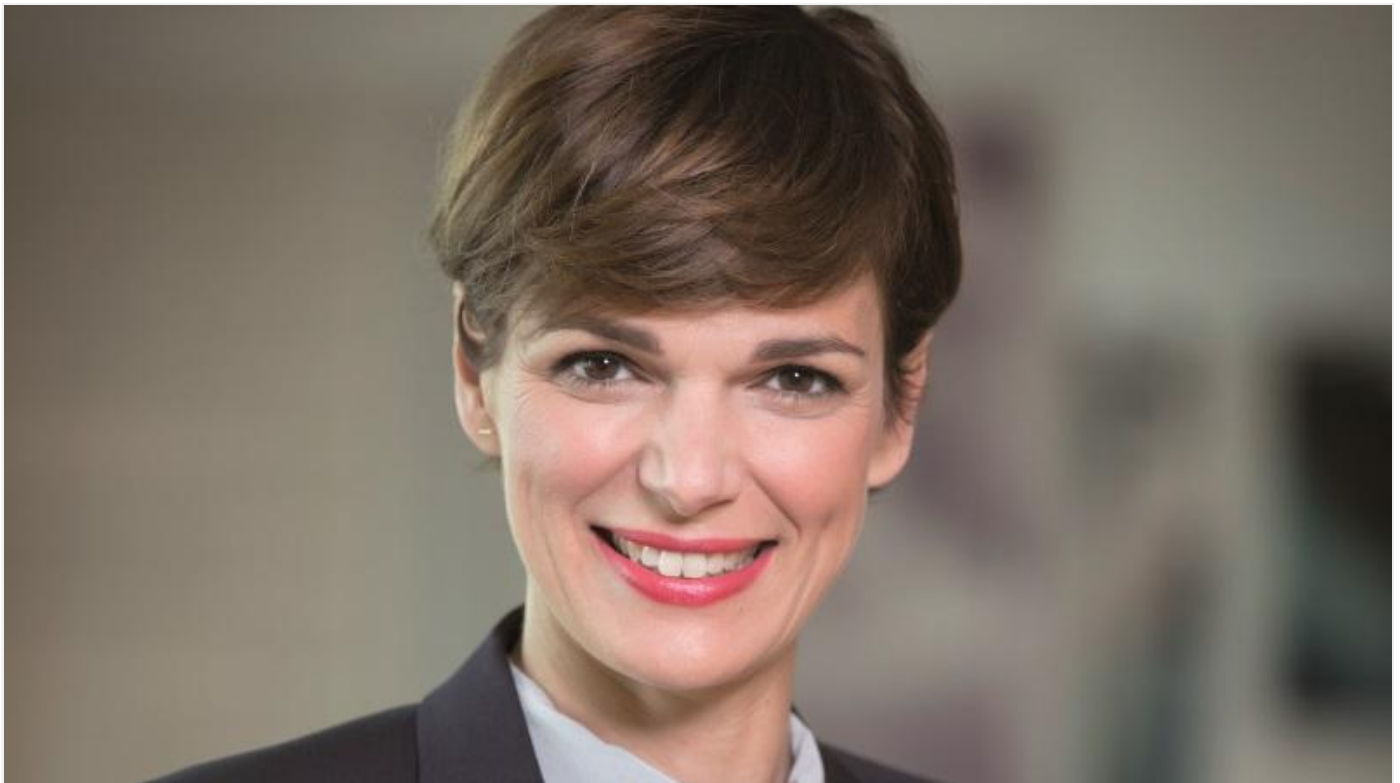
Pamela Rendi-Wagner

The European Health Forum Gastein will be a chance for Austria to present some of its priorities for its upcoming EU Council presidency, explains Pamela Rendi-Wagner.