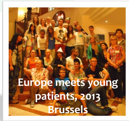
Europe meets young patients, 2013 Brussels