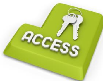
Healthcare Access and Quality