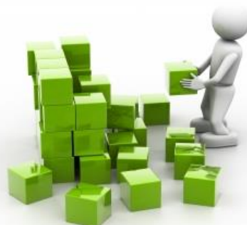
Sustainable Patients' Organisations