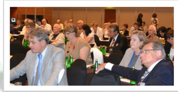
Conference on rights and needs of older patients, 2011 Warsaw