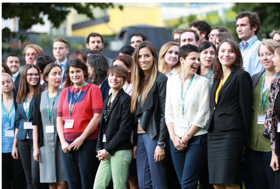
Young Forum Gastein scholars of 2016