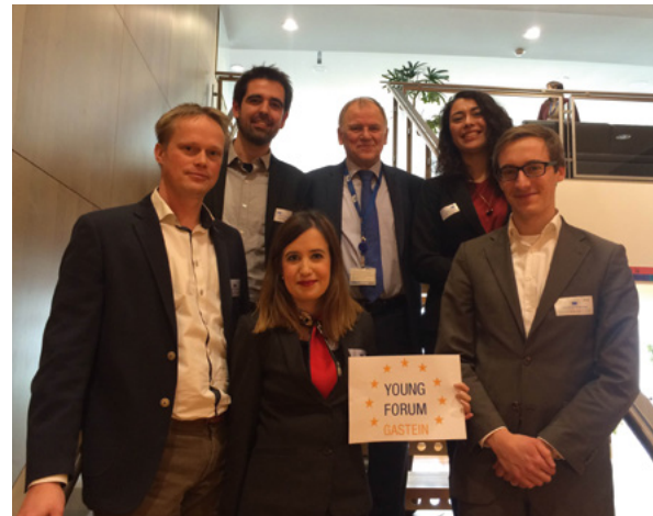
EU Commissioner for Health and Food Safety Vytenis Andriukaitis & Young Gasteiners (2015)