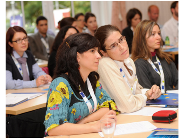
Closed workshop – career paths in international organisations