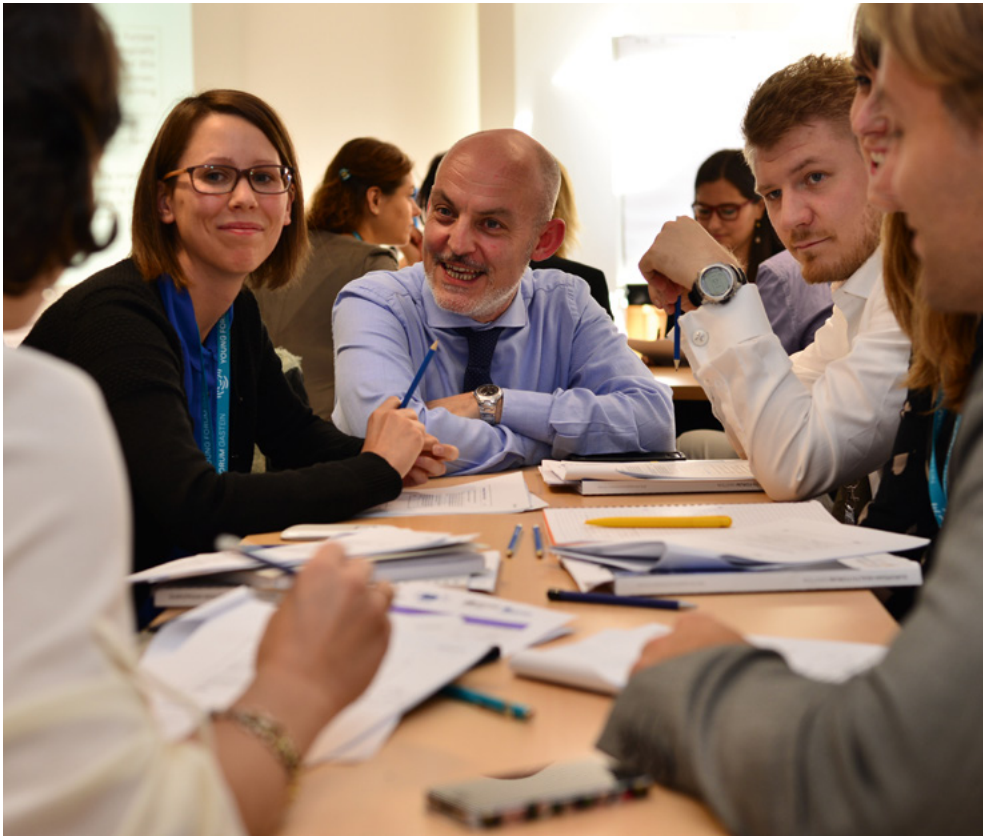
Skills-building workshop (EHFG 2016)