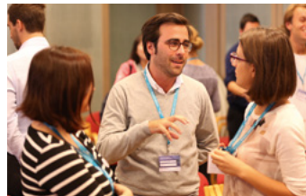
YFG kick-off meeting (2015)