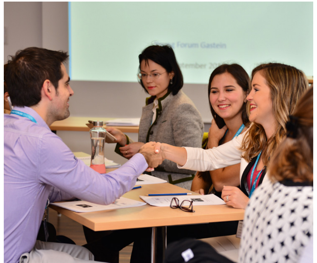
Public speaking and facilitation workshop (2016)