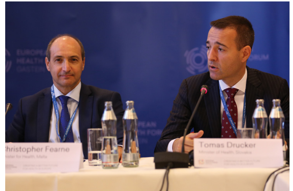
Christopher Fearné, Minister of Health of Malta and Tomáš Drucker, Minister of Health of Slovakia (EHFG 2016)

only looking at challenges, but also at chances – at the peak of a highly sensitive period. While decision-makers certainly do not leave the valley with ready-made solutions for major issues in health policy-making, they will hopefully have heard and discussed something new, which in turn will contribute to next steps or kick-start a new development. For the 2017 edition of our conference, being at the pulse of European health policy means facing up to heightened Euroscepticism, sometimes resulting in healthcare becoming a plaything of election campaign rhetoric – leaving frustrated and distrustful voters. Discussing health against this background now is in a sense perfect timing: It makes the look back at the past 20 years of EHFG, and thus of EU (health) policy, more meaningful – it reminds us of what has been achieved to date.